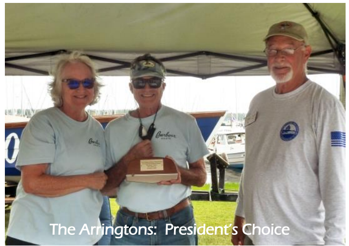
The Arringtons: President's Choice