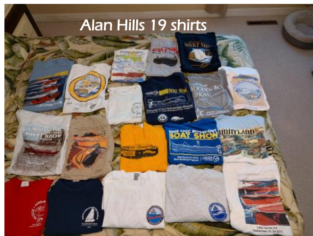
Alan Hills 19 shirts