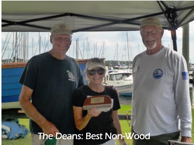
The Deans: Best Non-Wood