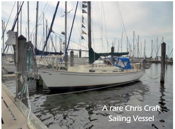
A rare Chris Craft Sailing Vessel