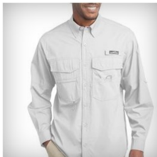
Long Sleeve Fishing Shirt Decorate from $65 USD