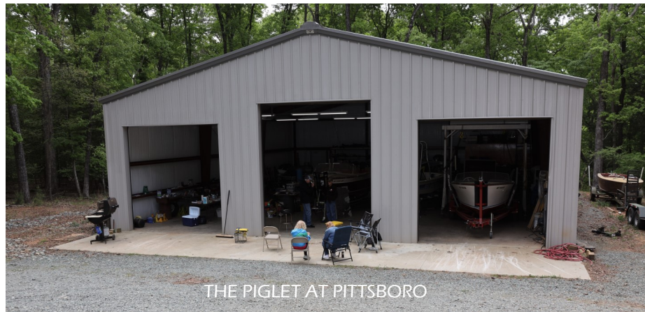
THE PIGLET AT PITTSBORO