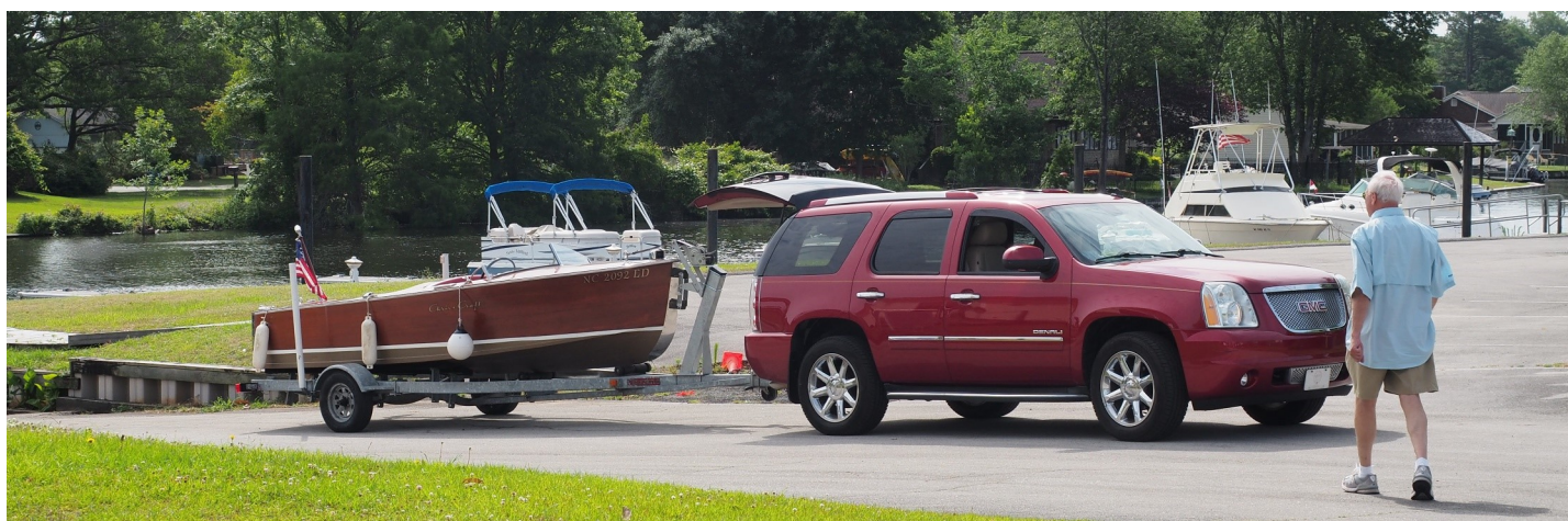
Launching the Conley's Blue Tango