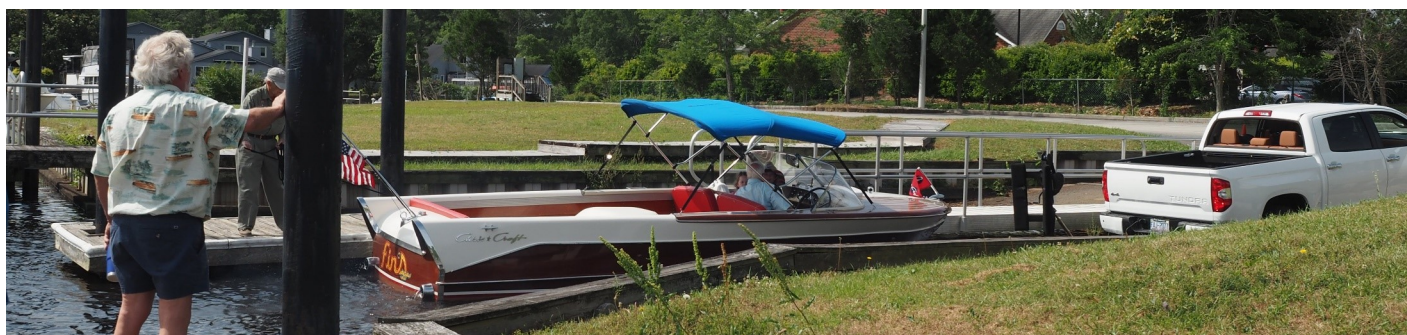
Launching John's Fins