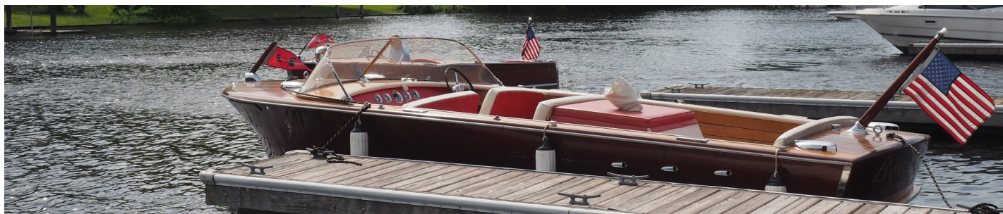
Jim's Boo-Boo at the dock