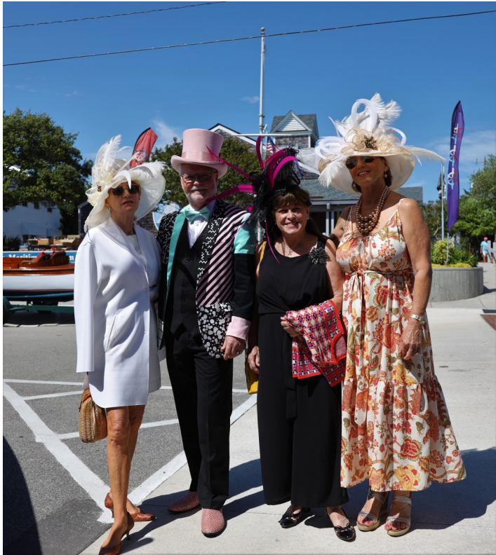
Just local folk dressed for a Derby Party