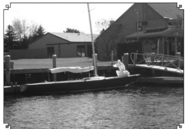
Sorcery—a 30 foot Etchells one of the several racing yachts we owned and raced