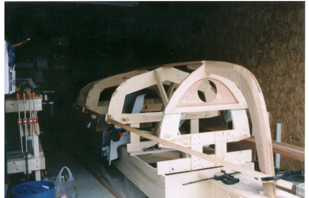
The station molds set up with stem and keelson installed.

After 18 months of working nights and a few hours here and there on the weekends, I finished the boat after about 400 hours of work (not including the mast, spars, and rigging). I named the boat after the nickname my wife and I have for our son – Little Fish .