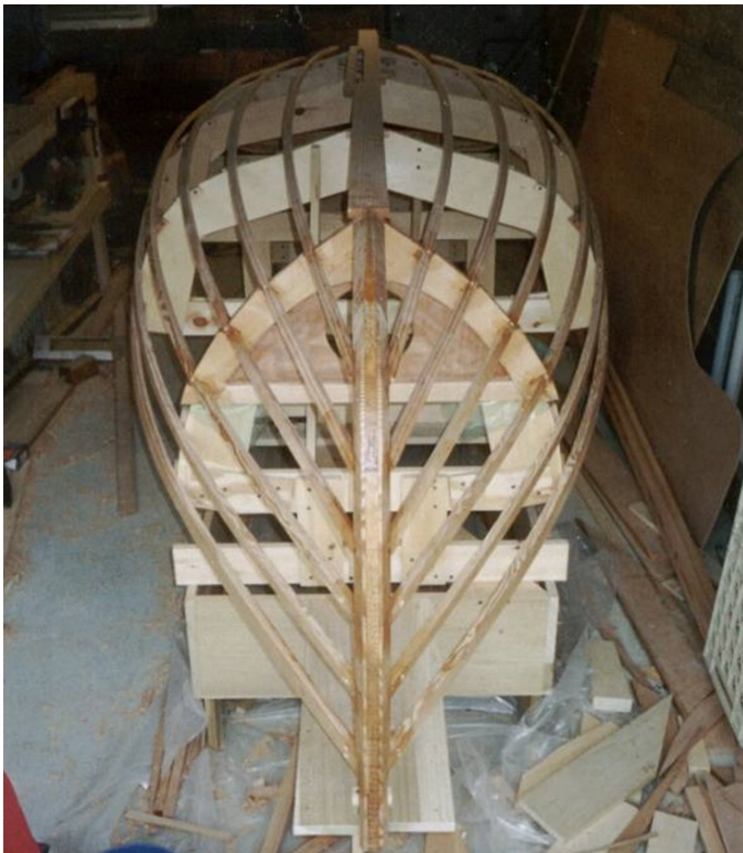
Stringers installed and ready for planking.

After always wanting boat, I decided to build one in a storage unit behind our apartment in New York. The largest I could manage to build in the space available would be 14' x 4' or so – this would leave about 1' fore and aft and about 18" on either side, after allowing for a 2' wide work bench. I settled on a glued lapstrake sailing dinghy designed by Arch Davis – his Penobscot 14 design.