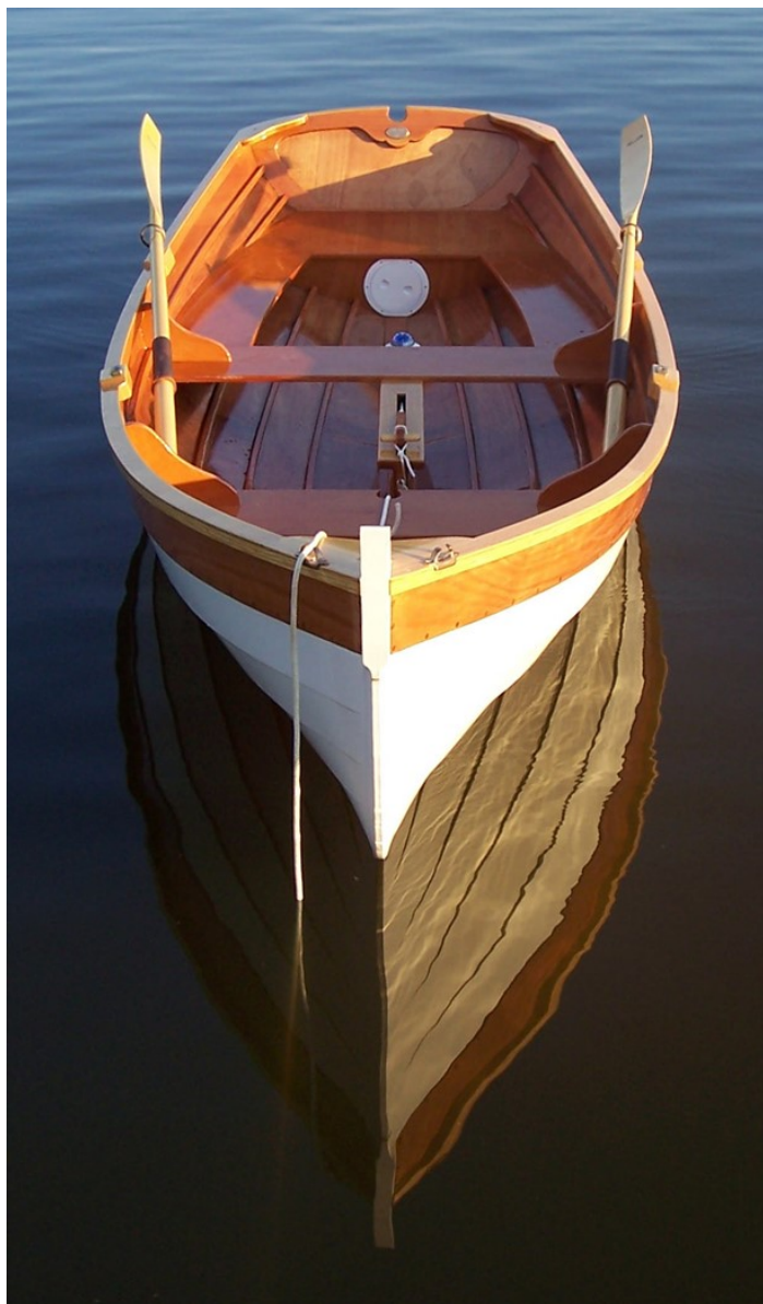
Little Fish on Falls Lake, 2004.