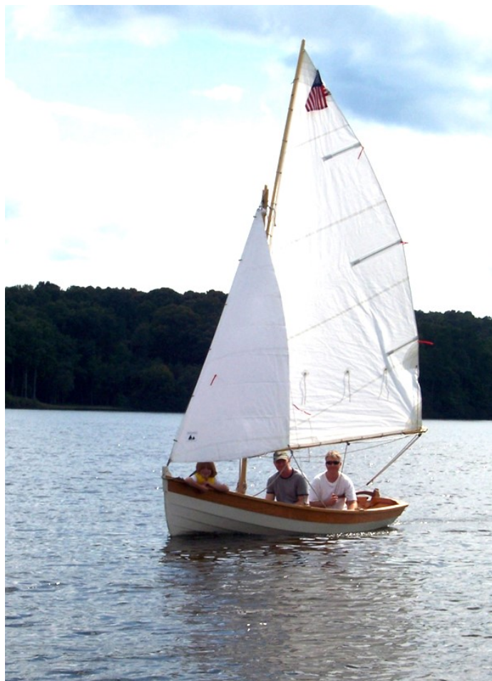
Little Fish on Lake Wheeler at the first RDC Triangle Chapter ACBS Antique and Classic Boat Show.