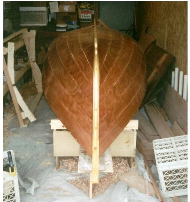
The hull completed and ready to be flipped.

We rowed Little Fish for a couple of years until we were able to commission a sail maker (I had no desire to sew my own sails) and purchase all of the supplies for rigging. It is because of this boat that I became involved with the RDC Triangle Chapter ACBS (now the NC Coastal & Piedmont Chapter). My son and I had stopped for lunch one day after a row on Falls Lake in the late summer of 2004 and when we came out there was a business card for the Chapter left under my windshield wiper. I decided to call and check it out, despite being a group of stinkpotters, and ended up joining and becoming one myself.