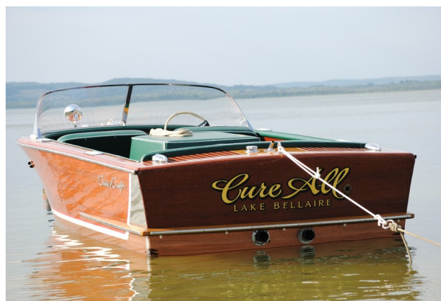
Last month's submission from Jon Homeister

Here is what we are hoping you'll provide: 1) Name of the boat; 2) Owned by; 3) Boat description; 4) Boat history; 5) How the boat got its name; and 6) Photo of the boat. Can't wait to see what you submit!