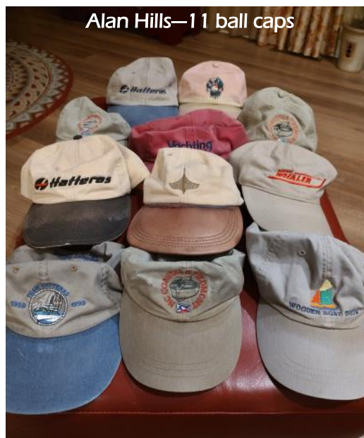
Alan Hills—11 ball caps

Last month we asked you to put all your ball caps that have a boating-related logo or picture on them in a pile and take a photo. You were to send the picture in to the editor along with the number of caps in the pile. The November Ball Cap contest was won by : Alan Hills—the only entry. Would have been interesting to see how many boating-related ball caps are owned by our various members.