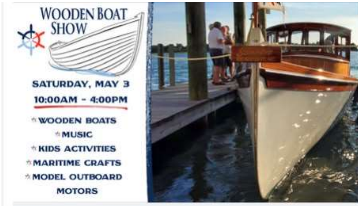
SHAD BOAT LEVEL

The 49th Annual Wooden Boat Show will be held May 3, 2025!